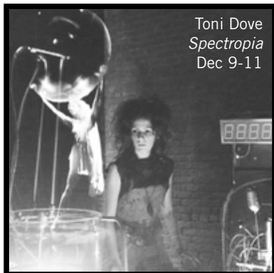
Toni Dove Spectropia Dec 9-11