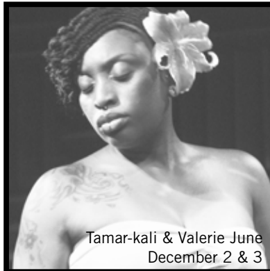
Tamar-kali & Valerie June December 2 & 3