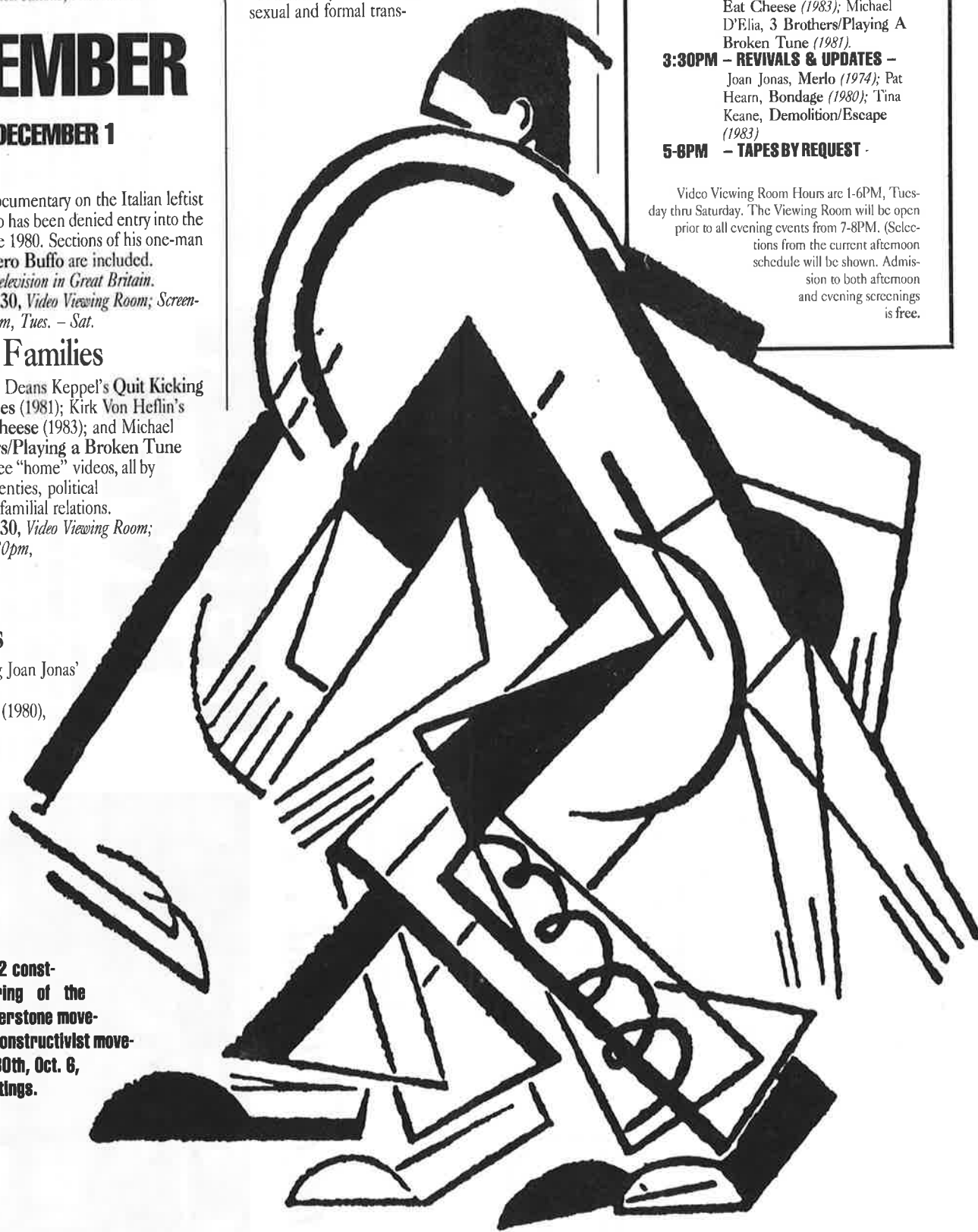
Shlepyanov's 1922 constructivist rendering of the "DACTYL", a cornerstone movement of Russian constructivist movement. See Sept. 30th, Oct. 6, 8, 13 & 15th Listings.

Video Viewing Room Hours are 1-6PM, Tuesday thru Saturday. The Viewing Room will be open prior to all evening events from 7-8PM. (Selections from the current afternoon schedule will be shown. Admission to both afternoon and evening screenings is free.)