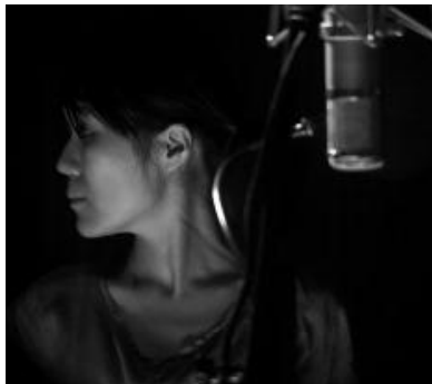
BAND , 2009 3-channel HD digital video, stereo sound 12 minute 29 second cycle Edition of 5 + 2 AP