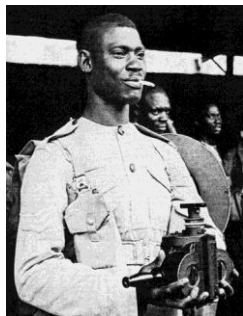
System of Display, IE ( WHILE/a West African N.C.O. with a photographer's movie camera, February 10, 1944 ), 2010 Silkscreen on glass and mirror