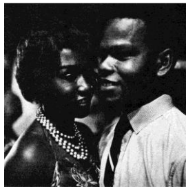
System of Display, L ( LOST/Ian Berry, couple dancing, Ghana, 1962 ), 2010 Silkscreen on glass and mirror