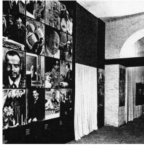
System of Display, IAL ( SIGNALS/Documenta I , Kunsthalle Fridericianum, 1955 ), 2008-2009 Silkscreen on glass and mirror