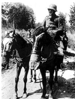
System of Display, X ( NEXT/a German soldier and transport horses with gas masks ), 2010 Silkscreen on glass and mirror