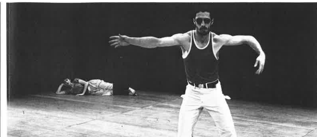
Steve Paxton and Lisa Nelson