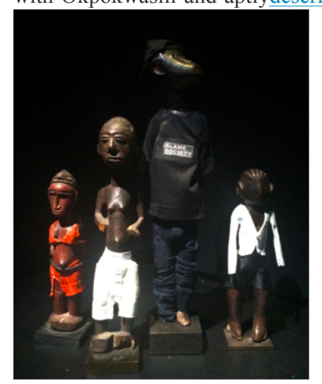
Detail of Ralph Lemon's 'Scaffold Room' installation in the Kitchen's gallery (click to enlarge)

Beyoncé is foremost among Scaffold Room 's constellation of iconic women, though <u>Kathy Acker</u> and <u>Moms Mabley</u> also figure prominently, and along the way brief passages are devoted to Lady Gaga, Amy Winehouse, and others. But even the phrase "along the way" probably suggests more linearity than there is in Lemon's work. The entire dance-musical-performance art piece, which Lemon developed in collaboration with Okpokwasili and aptlydescribes as "a one-woman show played by two women," is