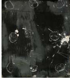
Joe Winter Verso , 2011 54 x 48 inches Photograph on adhesive vinyl