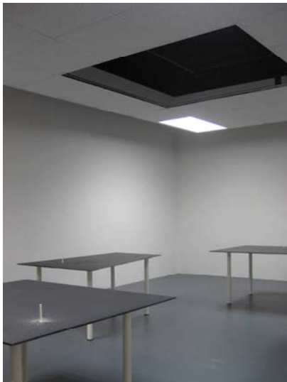
Joe Winter The Stars Below , 2011 Dimensions variable Mixed media installation with chalk, slate, drop ceiling, water