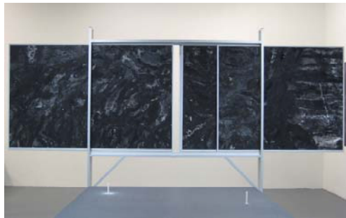
Joe Winter A Record of Events (II) , 2011 Dimensions variable Dry erase ink on dry erase panels, aluminum track and frame