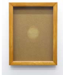
Joe Winter Untitled Model for a History of Light (void) , 2010 32 x 24 x 4 inches Wood, UV-faded cork, perforated UV-laminate glass