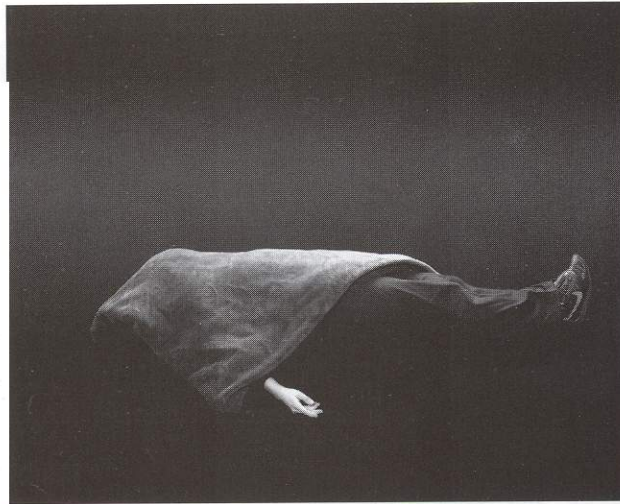
Miranda Lichtenstein, Untitled , 2005, color photograph, 10½ x 13¾".

Resolutely nonlinear and multivalent, Sandra of the Tuliphouse exhibits all the