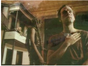
"The One I Love" R.E.M., 1987 Edited by Gretchen Bender, directed by Robert Longo