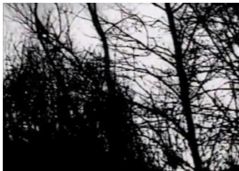
"Boy (Go)" Golden Palominos, 1985 Edited by Gretchen Bender, directed by Robert Longo