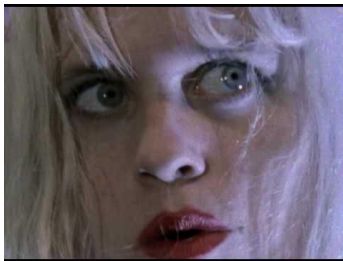
"Bruise Violet" Babes in Toyland, 1992 Directed by Gretchen Bender