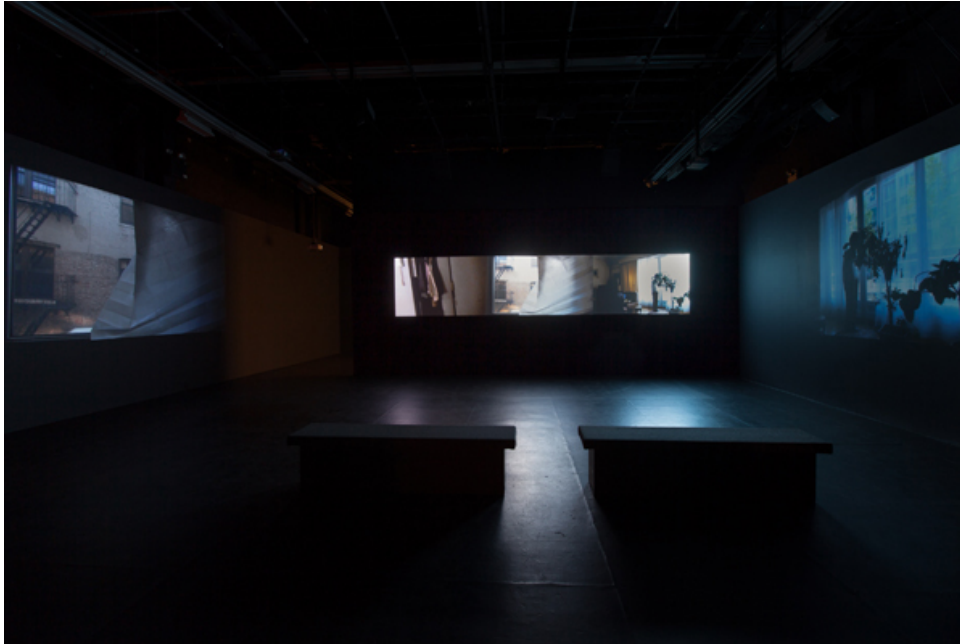
View of “Chantal Akerman: Maniac Shadows,” 2013.

“And here or elsewhere, I don’t have a life. I didn’t know how to make one. All I’ve ever done is leave and come back.” – Chantal Akerman, My Mother Laughs